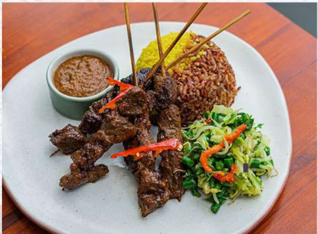
PORK SATE 🍷 100K

Grilled chicken skewer with peanut sauce, sayur urap "Balinese vegetables", steamed yellow and red rice