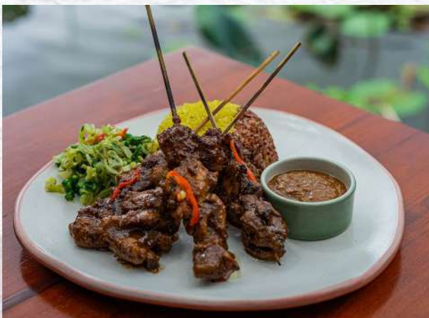
SATE AYAM 105K

Braised chicken leg with Sumatran style chili sauce "rendang sauce" sayur urap and steamed yellow rice