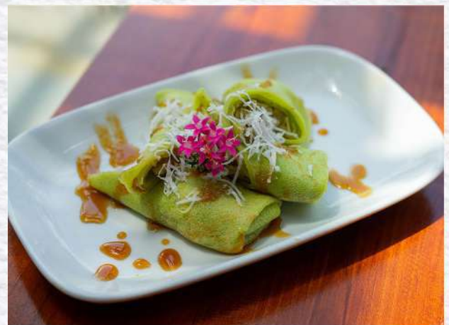
BALINESE CREPES 🌸

Fried banana with palm sugar and vanilla ice cream; poached coated banana with batter, grated coconut, and palm sugar syrup