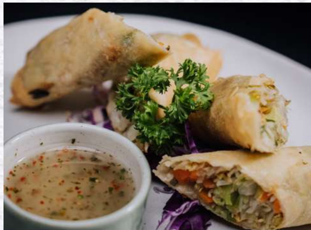
INDONESIAN SPRING ROLL 65K

Deep-fry marinated chicken wing with homemade flour, tartar sauce and Thai chili dipping sauce