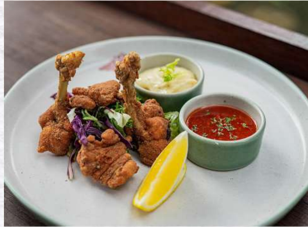
CRISPY WINGS 78K

Freshly rice paper rolls with shrimp, beansprouts, carrot, cucumber, radish, mint, cilantro, with chili, soy dipping sauce