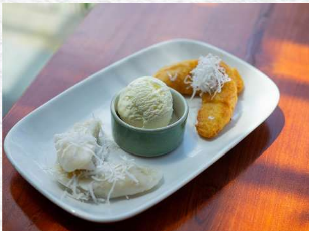
JAJAN PISANG 🌸