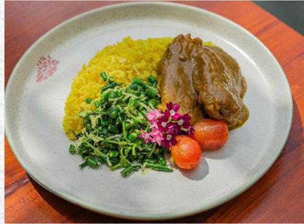
RENDANG AYAM 115K

Balinese stewing pork loin in garlic shallot, coriander, soy, and tomato sauce with acar and steamed rice