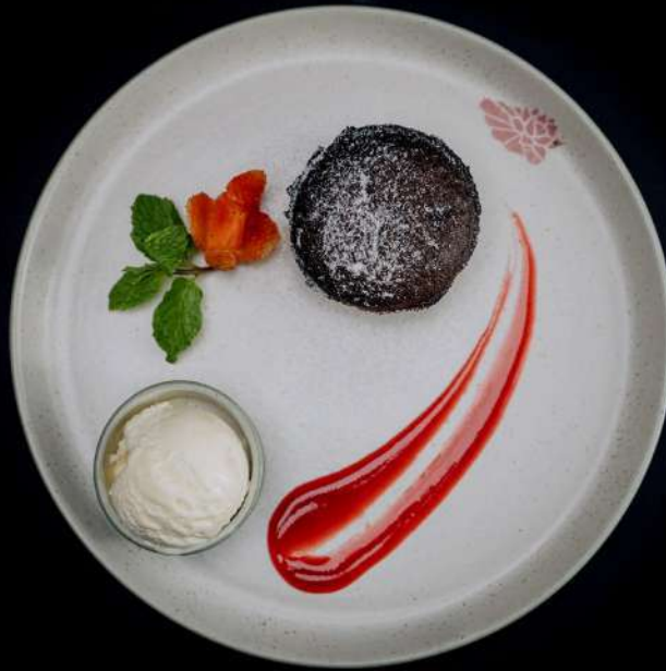
CHOCOLATE BROWNIES WITH VANILLA ICE CREAM