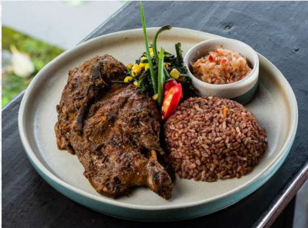
BEBEK BETUTU 🌸 🌶️ 185K

Roasted half duck in fragrant Balinese spices, with fern tips sayur urap "Balinese vegetables", sambal matah and steamed red rice