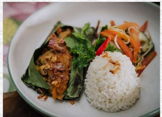
BE-PASIH GOA LAWAH 🌶️ 🌸 125K

Grilled mackerel fillet with sautéed fern tips, sweet corn and Balinese sauce