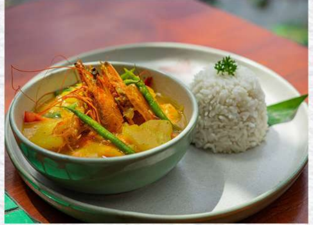
KARE UDANG 🌶️ 135K

Prawns in chili sambal with vegetable "plecing kangkung" and steamed rice