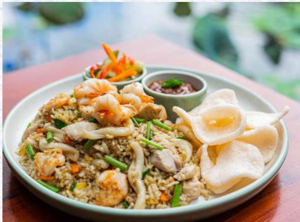
LOTUS SEAFOOD NASI GORENG 🌸 128K

Tiger prawn in yellow curry sauce with pineapple, tomato, long bean, basil, and steamed rice