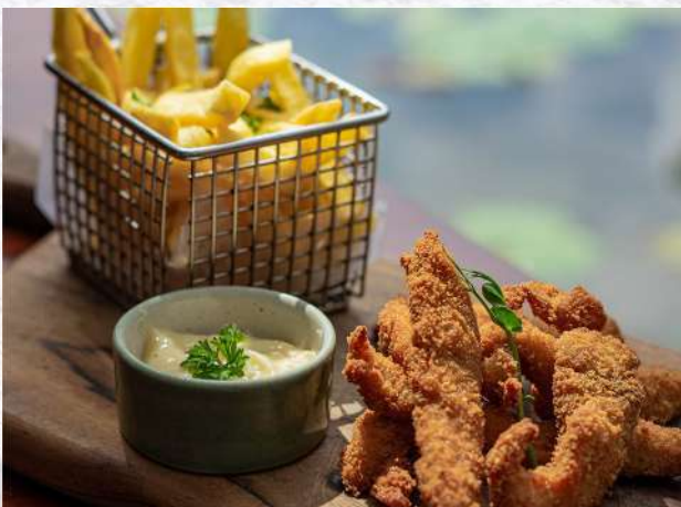
CHICKEN AND CHIPS 65K

Deep-fry vegetables spring rolls with sweet sour sauce