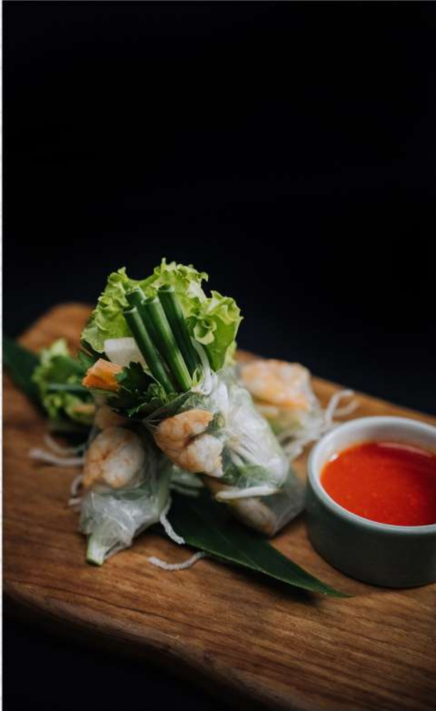
VIETNAMESE SPRING ROLL 🌿 70K

Freshly rice paper rolls with shrimp, beansprouts, carrot, cucumber, radish, mint, cilantro, with chili, soy dipping sauce