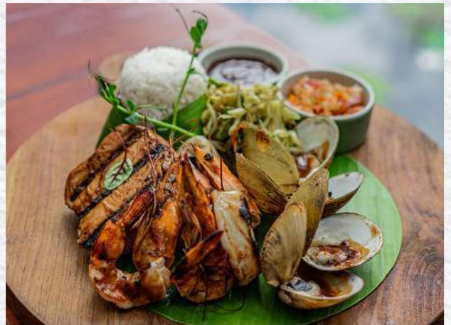
SEAFOOD PLATTER 🌶️ 135K

Wok stir-fry rice with prawns, fish, calamari, egg, spring onion, garlic, crackers, acar and sambal