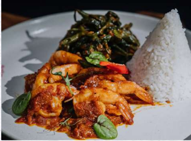
SAMBAL UDANG 🌸 🌶️ 135K

Prawns in chili sambal with vegetable "plecing kangkung" and steamed rice