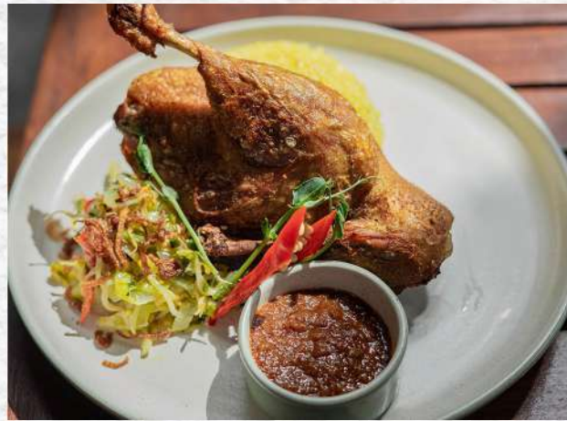
BEBEK GARING 🌶️ 185K

Roasted half duck in fragrant Balinese spices, with fern tips sayur urap "Balinese vegetables", sambal matah and steamed red rice