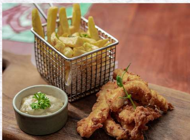
FISH AND CHIPS 65K

Deep-fry breaded sliced chicken with French fries and garlic aioli