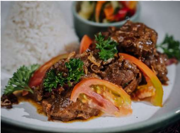
BABI KECAP 🍷 🌶️ 128K

Half crispy duck with sayur urap "Balinese vegetables", yellow rice and tomato sambal