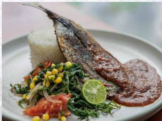
MACKAREL MEPANGGANG 🌶️ 115K

Grilled tuna fillet, tiger prawn, calamari, clam with sayur urap, steamed rice, sambal matah and tamarind chili sambal